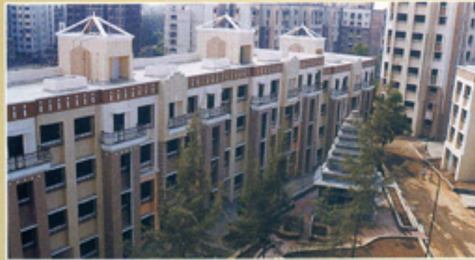
Mohan Park - Kalyan (W) 350 Families Happily Living