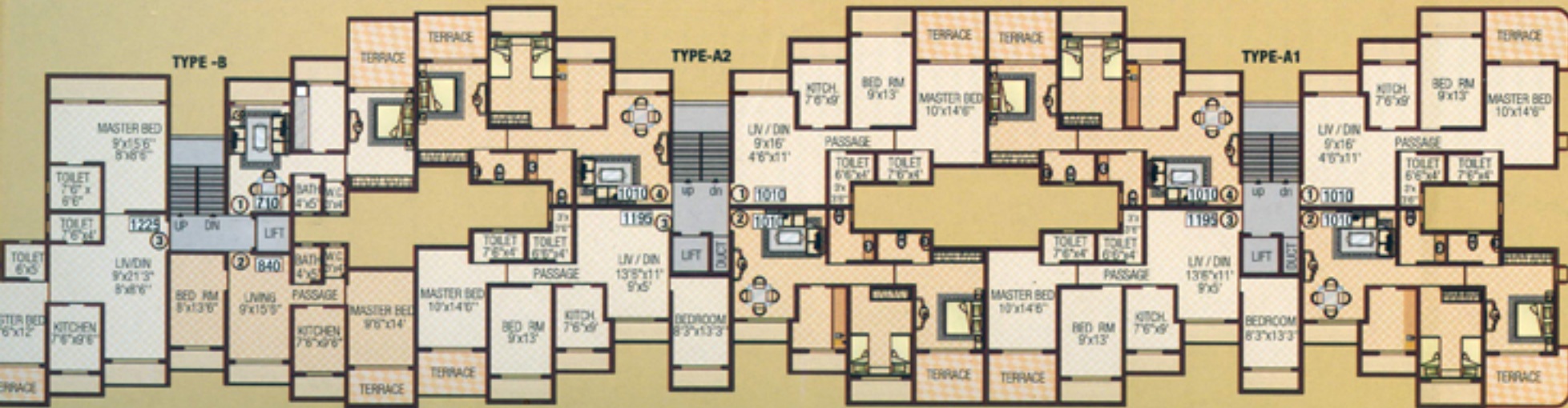
TYPICAL FLOOR PLAN 2ND, 4TH & 6TH FLOOR