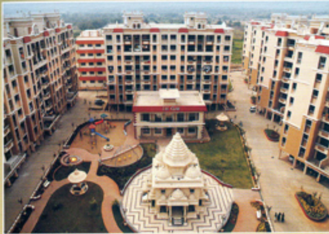
Mohan Regency - Kalyan (W) 450 Families Happily Living