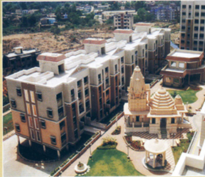
Mohan Puram - Ambarnath (E) 450 Families Happily Living