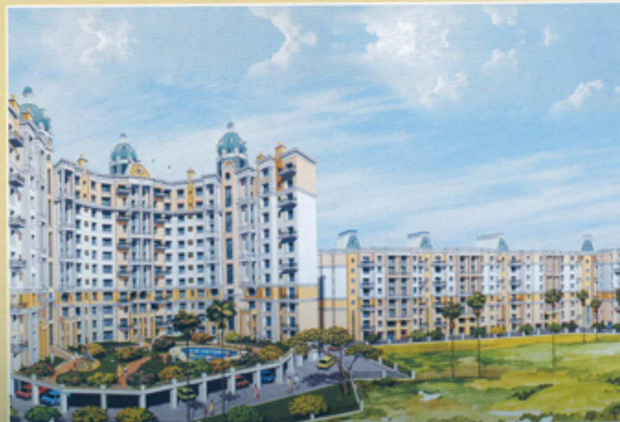
Mohan Heights - Kalyan (W)